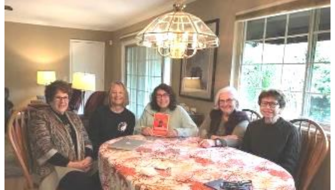
March Reading & the Rainbow afternoon (above) and evening (below) groups