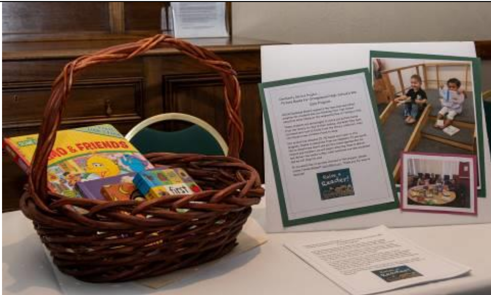
Orangewood HS Service Project New Picture Books