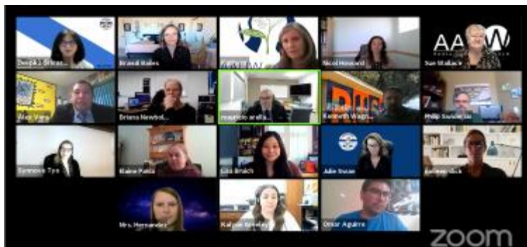
"Welcome" segment for the March 5 th RUSD conference