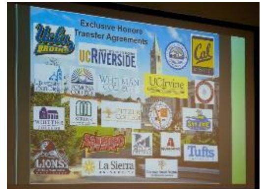
"College Honors Institute at Crafton Hills College"