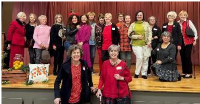
Adult Literacy / CHAT Holiday Party