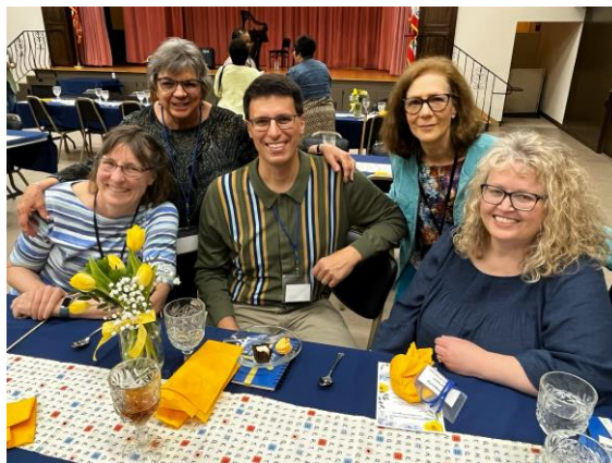
Adult Literacy Honors Their Volunteers