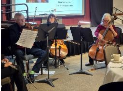
December 3, 2024 Branch Meeting Recap